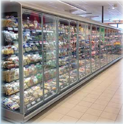
▲ VERTICAL MULTIDECK COOLER WITH DOORS