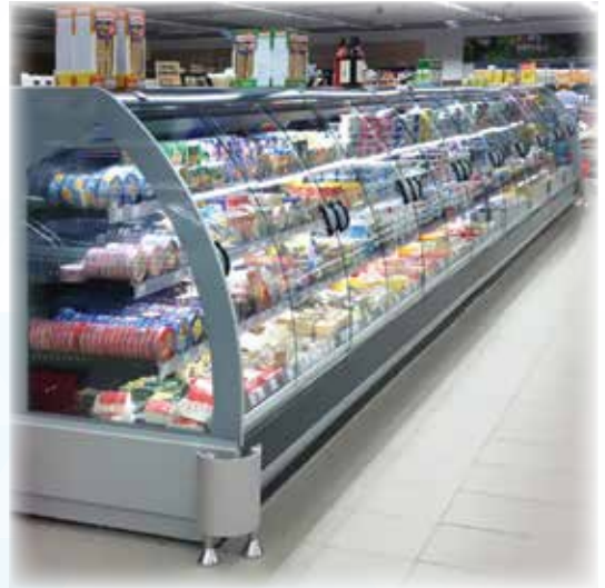
▲ CLOSED SEMI VERTICAL COOLER