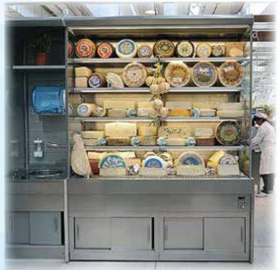
▲ REAR CABINET