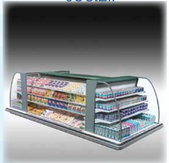
▲ OPEN SEMI VERTICAL COOLER