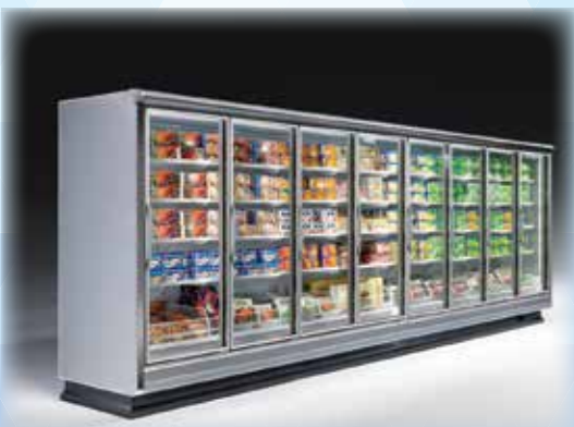
▲ VERTICAL FREEZER WITH DOORS