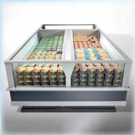
▲ OPEN ISLAND FREEZER