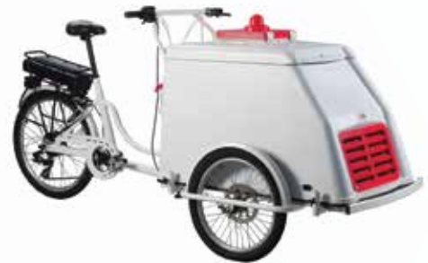
▲ PUSHY TRYKE