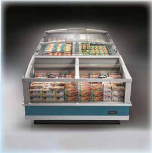
▲ CLOSED ISLAND FREEZER