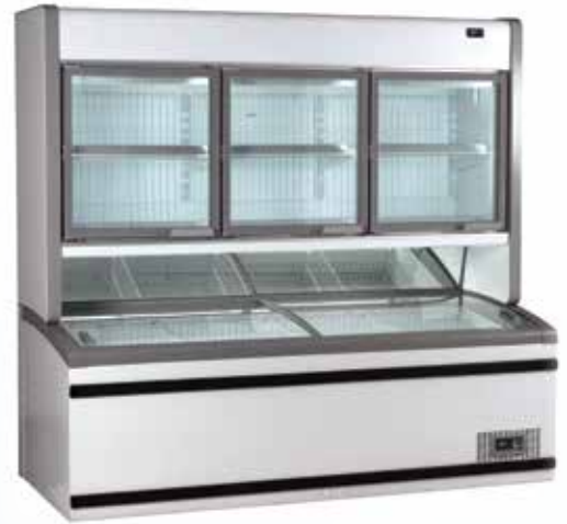
▲ COMBI AR