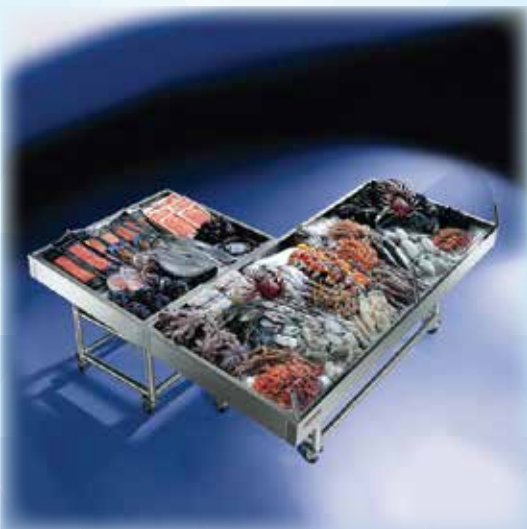
▲ FISH DISPLAY CABINET