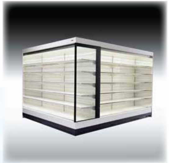
▲ OPEN VERTICAL MULTIDECK COOLER