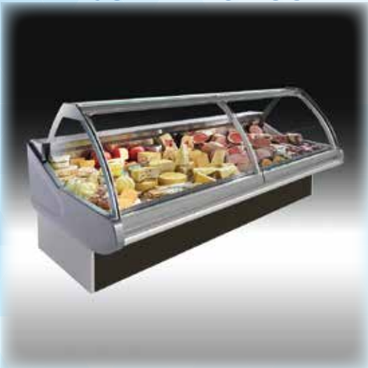
▲ SERVE OVER COUNTER CURVED GLASS