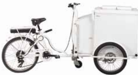
▲ MBC 125 BIKE